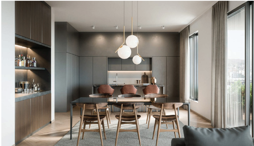
Penthouse / Conceptual View