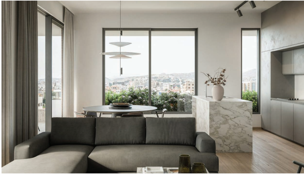
↑ Typical Apartment / Conceptual View