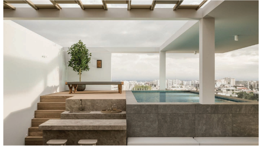
↑ Roof Garden / Conceptual View