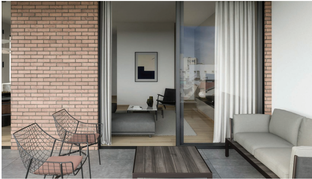
↑ Typical Apartment / Conceptual View