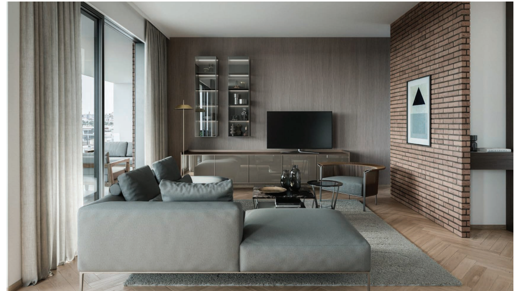
Penthouse / Conceptual View