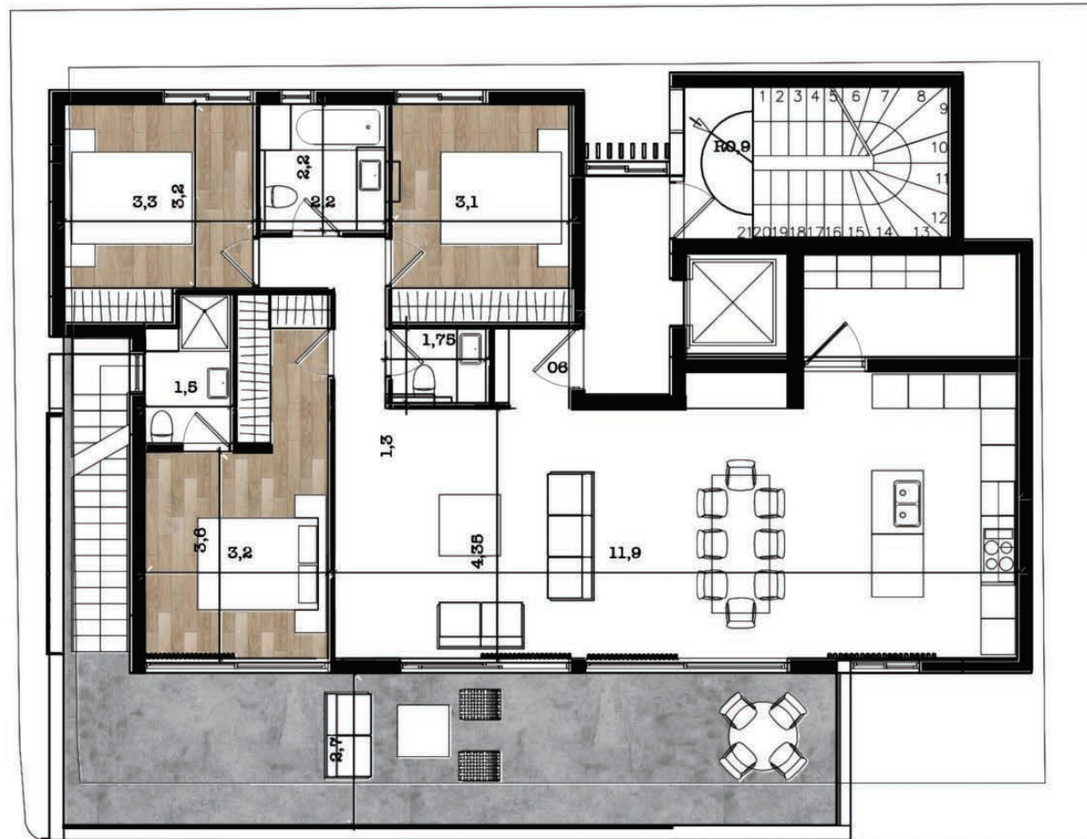
Fourth Floor Plan