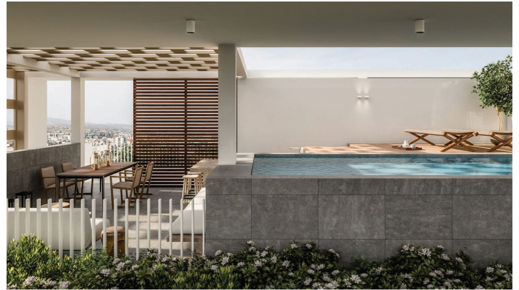
↑ Roof Garden / Conceptual View