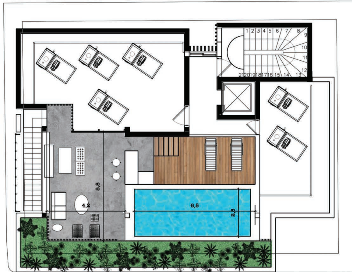
Roof Garden Plan